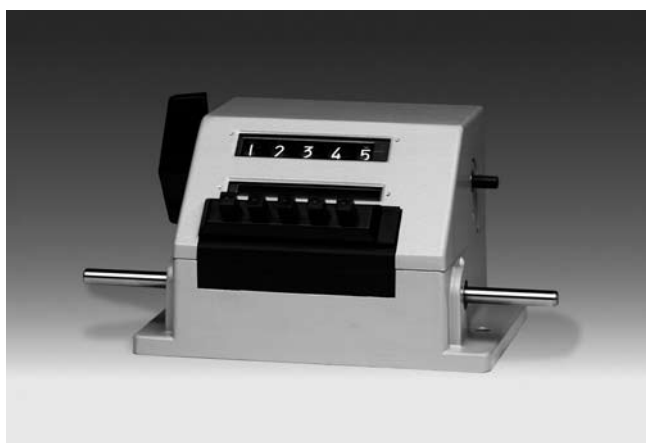
UE280 - Revolution counter