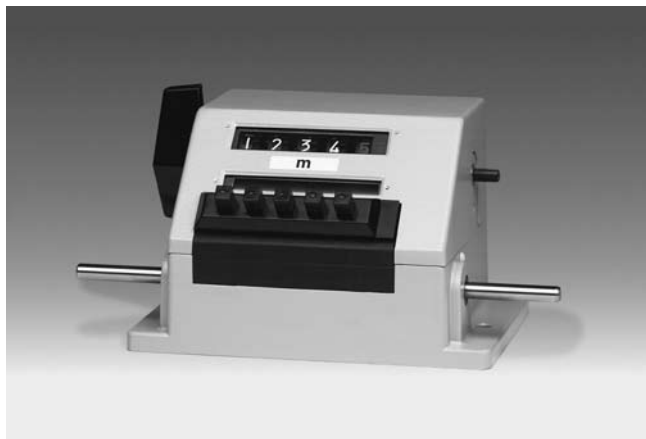
ME280 - Meter counter