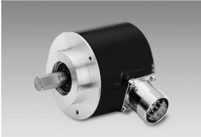
GA240 with clamping flange