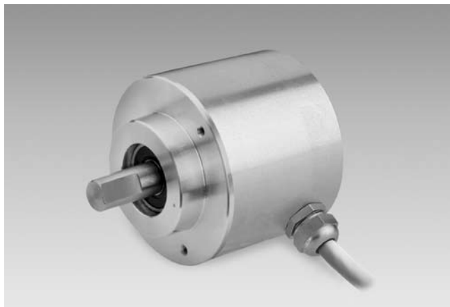
GE355 with clamping flange